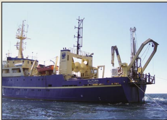
El Puma - the vessel used by Gregg Drilling for off shore investigations in the Sea of Cortez.

October of 2005 brought the perfect escape for a lucky number of Gregg employees as they started work in the Sea of Cortez off the coast of Mexico. The site investigation was for a proposed LNG Facility for El Paso Energy. Gregg Drilling worked for Fugro West to complete 12 boreholes and 12 CPT's up to a maximum depth of 100 feet below the mud level in water ranging from 30 to 60 feet deep. (cont. on reverse...)