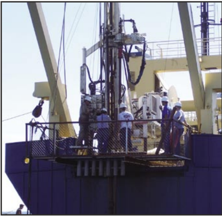
B-80 Drill rig during investigation in Puerto Libertad, Mexico.

Offshore Drilling cont... Borings were drilled with Gregg's mud rotary B-80 drill rig mounted on a vessel borrowed from the National Autonomous University of Mexico (UNAM). This 200 foot research vessel named El Puma had a crew of 15, to which Gregg added 6 drillers (2 crews consisting of 3 men each) as well as 4 client representatives. This group of over 20 "vacationers" worked round the clock for 10 days in order to complete the project. Only one 12 hour shift was lost due to weather delays and Gregg was able to successfully transport their B-80 drill rig across the border and back with little difficulty or time delay. It's safe to say that everyone wanted a real vacation after completing this logistically challenging, yet rewarding project!