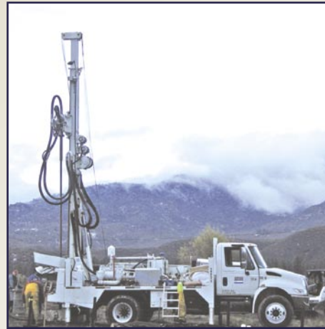
Gregg Drilling's truck mounted Fraste rig.

In recent years, Gregg Drilling has taken delivery of a new line of mud rotary drilling rigs. Manufactured in Italy by Fraste, these rigs boast top head drive configuration which is excellent for soil and rock coring. With two tracked drills in Southern California and one truck and one track drill at Pitcher Drilling in Northern California, Gregg has dramatically increased their coring capabilities on the West Coast. (cont. on reverse...)