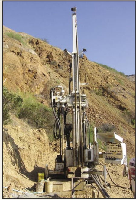
Track mounted Fraste rig working in a difficult access location.

The Fraste rigs work with Gregg's 101mm and Pitcher Barrel sampling systems for soil coring and easily move to NQ, HQ, PQ, and BQ systems for coring through rock. Along with the extensive coring capabilities these rigs offer, they are also equipped with standard 140lb automatic hammers for Standard Penetration Testing and can be used